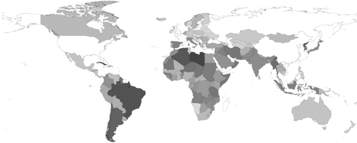
Figure 1. Countries Included in Matched Sample – Pursuit